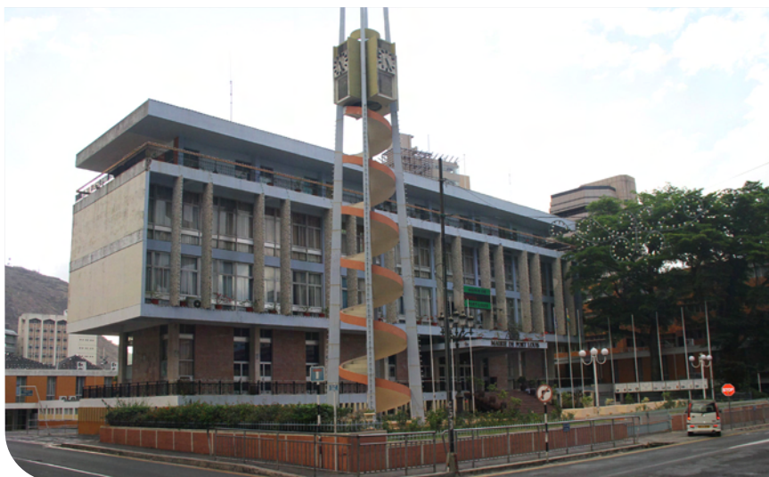
Municipal offices in Port Louis