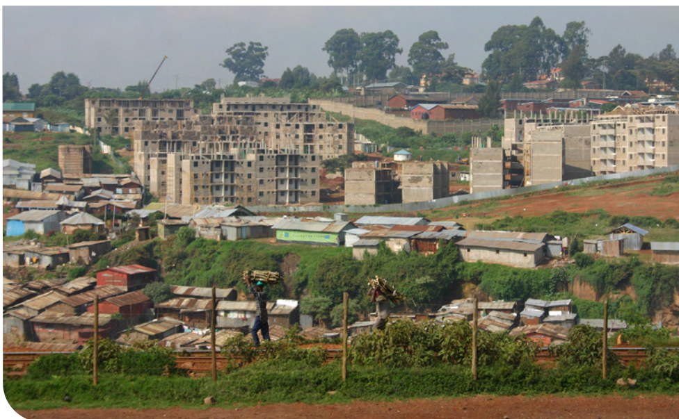
City revenues cannot cope – housing built using external funding