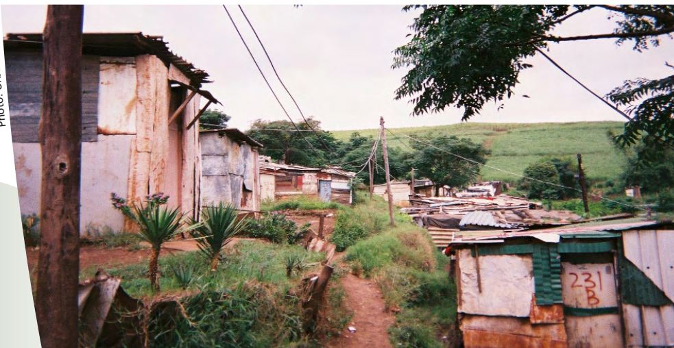
Electricity services usually benefit national utilities, not local city economies