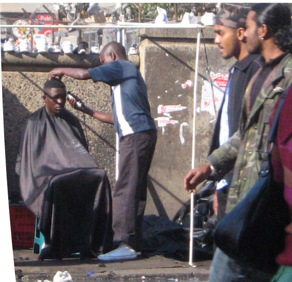
Small-scale commercial activities thrive but are mostly below a taxable threshold

About 65% of the local economy of Lusaka is in the informal sector. Nearly one-quarter of Lusaka's inhabitants were not born in the city, 70% of the city population are below the age of 30, and 57% are below the age of 20. The rapid growth of the city is associated with more informal settlements and a general degradation of the quality of the urban environment. Slum dwellers make up an estimated 50% to 60% of the urban population of Lusaka.