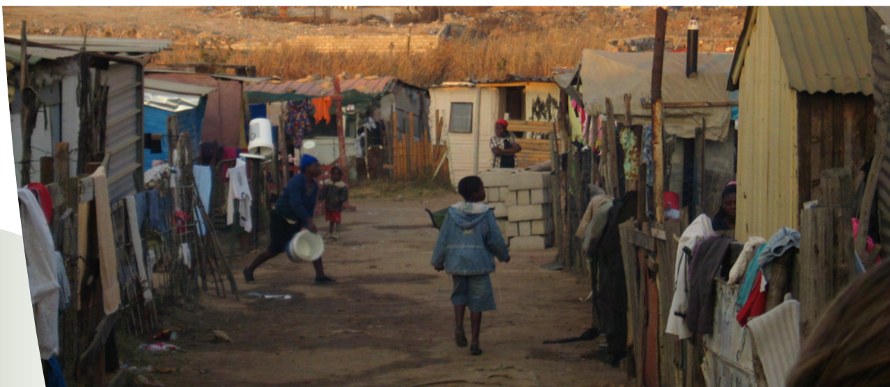
Rapidly growing populations