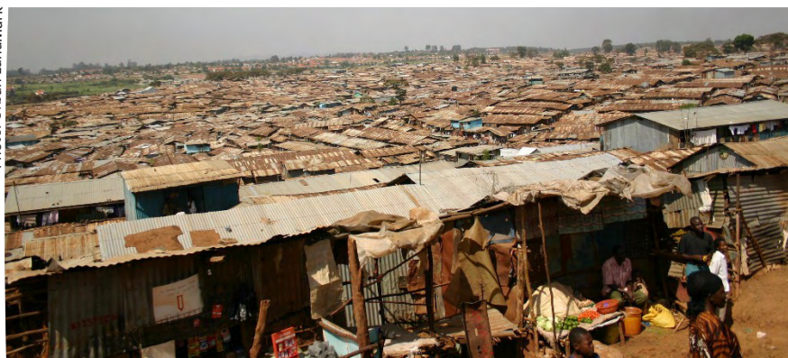
Kibera, outside Nairobi

Another challenge facing Southern African city governments in relation to revenue issues is the nature of most of the region's cities.