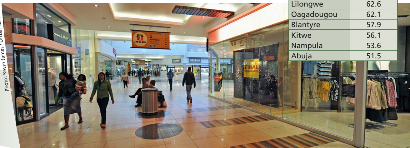
City economies in Southern Africa are growing