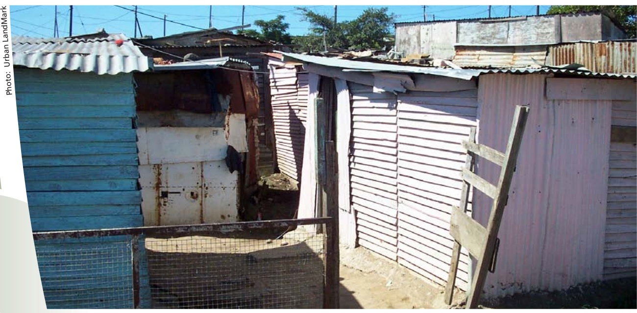
Affordability excludes these people from the formal housing market