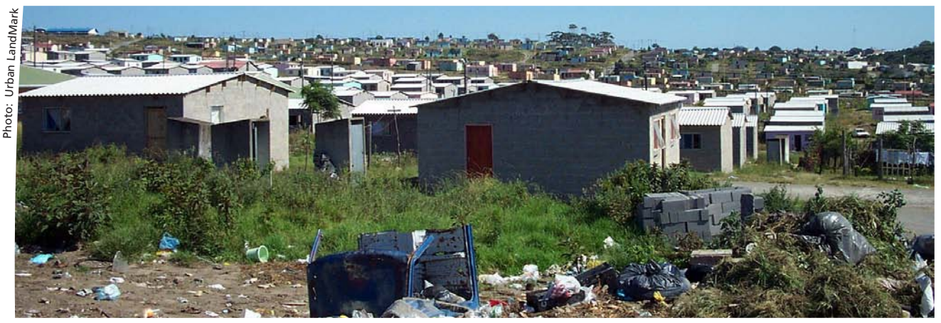
Direct state involvement in the provision of housing is inevitable

Where affordability is below the ability of market players to supply accommodation options for a competitive return and at an acceptable risk, the market will cease to operate.