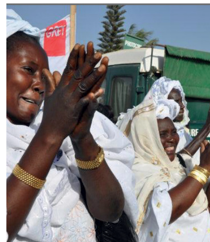
The role of women in society was much discussed at the Dakar World Social Forum in 2011