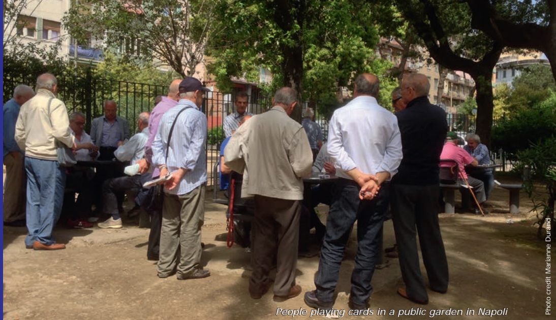
People playing cards in a public garden in Napoli