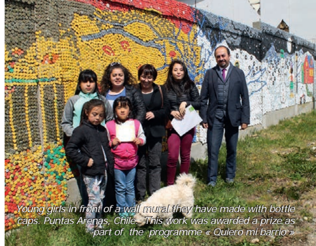
Young girls in front of a wall mural they have made with bottle caps. Puntas Arenas, Chile. This work was awarded a prize as part of the programme « Quiero mi barrio »