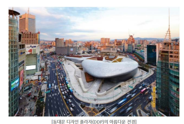
[등대문 디자 한 글디자(DDF)의 자급되운 현경

Since the 1960s, a fashion cluster has spontaneously grown in the Dongdaemun area. Handling the industry's entire process from design to production and distribution, the area has played a pivotal role in turning fashion into one of South Korea's key industries.