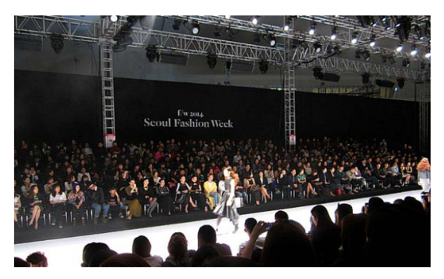
Fashion show held at DDP during the 2014 Seoul Fashion Week.