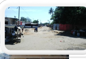
Drainage construction in Chamanculo C