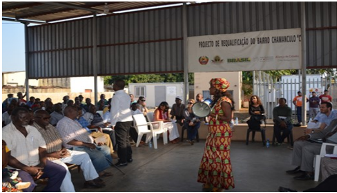
Project Consultation Meeting in Chamanculo C