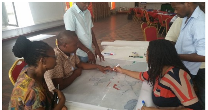
FCA Resilience Capacity Building Workshop in Nampula