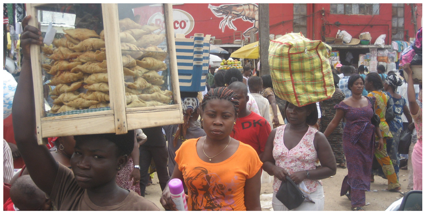
Young girls hawking goods in Accra, Ghana]