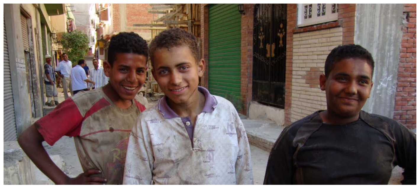
Three young Egyptian boys on a street in Cairo.

To provide a flexible platform for successful projects to develop peer-to-peer learning networks and to systematically extract and share knowledge that both informs and influences urban practices as well as policy dialogues at the local, national and global level.