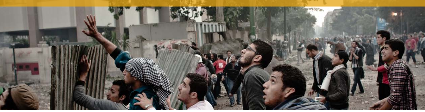
Youths protesting against government rule in Cairo