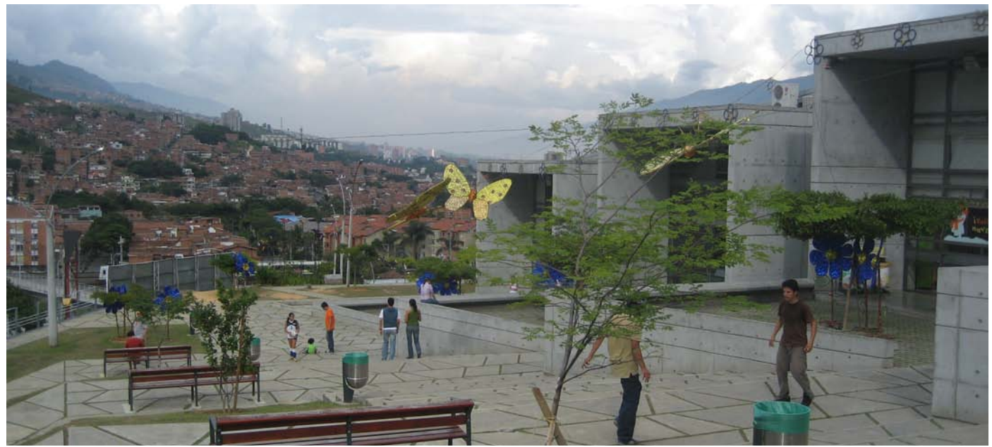
San Javier Park Library, Medellin, Colombia.