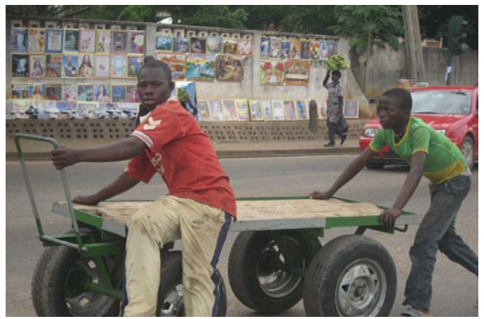
Young boys pushing a cart in Accra, Ghana].

The inability to find employment creates a sense of uselessness and idleness among young people that can lead to increased crime, mental health problems, violence, conflicts and drug taking.<sup>11</sup> There is a demonstrated link between youth unemployment and social exclusion.