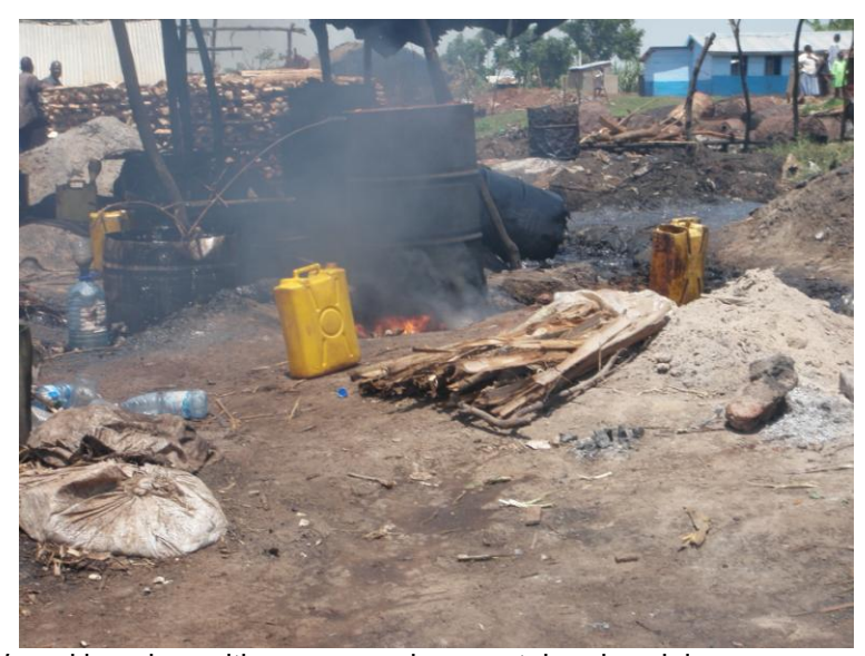
Waragi brewing, with severe environmental and social consequences

A key theme that cuts across all 5 municipalities is the negative environmental and economic consequences on the household and broader economy due to insufficient and inefficient energy availability and use. The absence of reliable sources of energy is a major inhibiter of urban economic growth, as well as impacting negatively on the daily quality of life of ordinary Ugandans. To help overcome these challenges, the Cities Alliance has entered into a partnership with the Energy Sector Management Assistance Program (ESMAP), which will focus on both energy efficiency and access to sustainable energy as part of this programme.