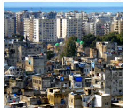
View of Tripoli, Lebanon