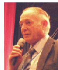
Mayor of Tripoli Speaking at the CDS Launch