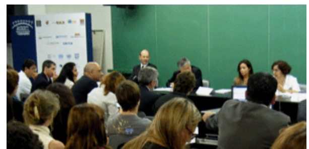
Cities Alliance-organised Workshop on Urban Regulation

Porto Alegre, Brazil hosted the "World Conference on the Development of Cities: Democratic innovation and social transformation for inclusive cities in the 21st century." from 13-16 February 2008. The conference brought together 7,000 mayors and city councillors, academics and experts, community leaders, business people, and social workers to discuss the importance of cities and the diversity of social innovation and transformation initiatives that have been emerging. The conference focused on four themes: 1) the right to the city, 2) governance and democracy in cities, 3) local development in cities, and 4) sustainability and the network-city.