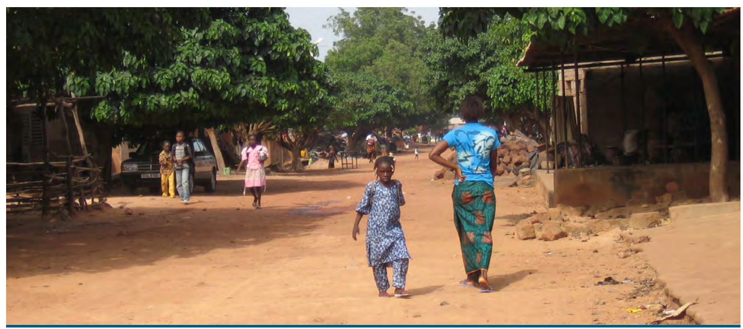
Street scene in Bobo Dioulasso, Burkina's second largest city.