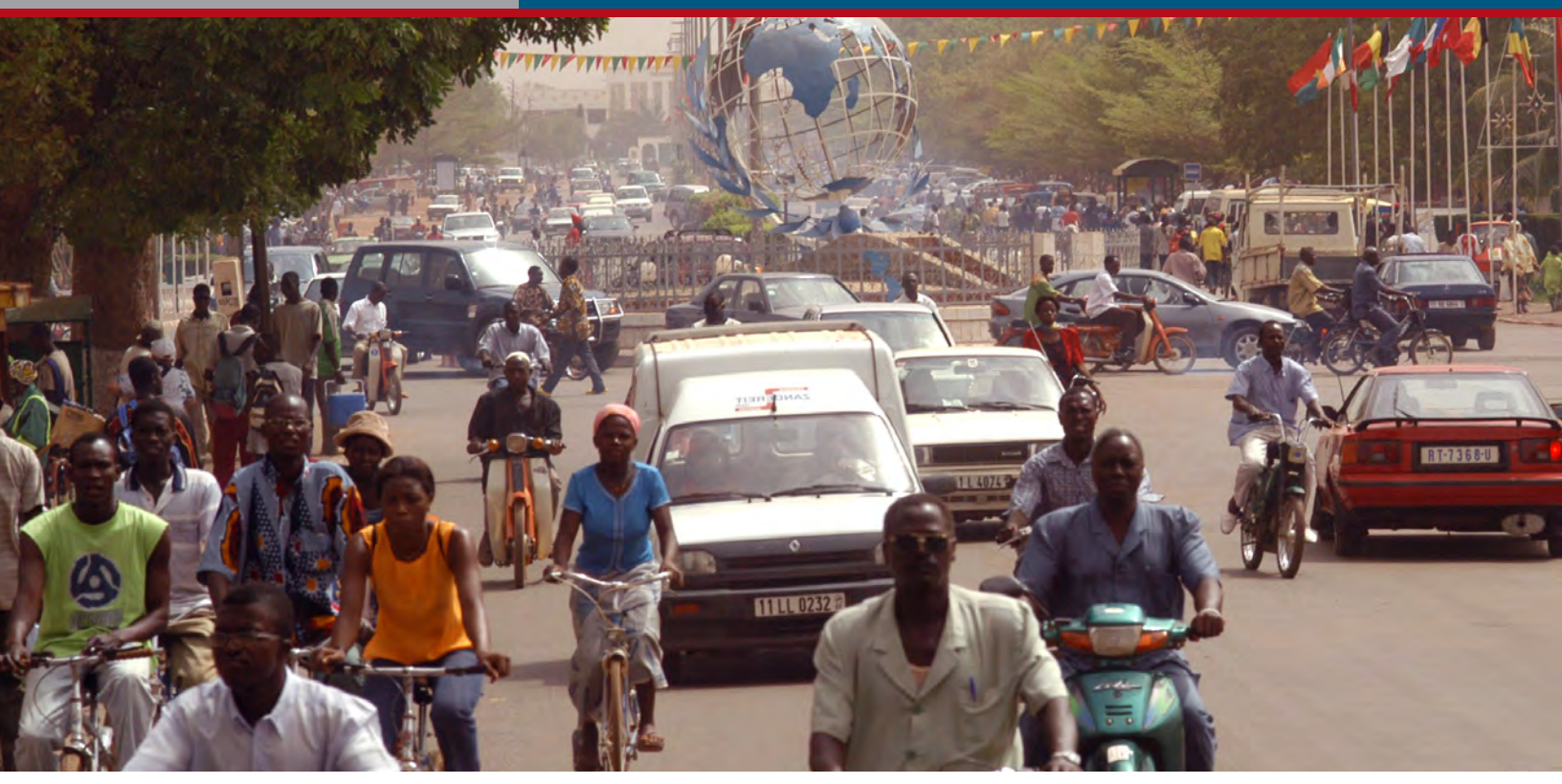
The United Nations Square in Ouagadougou.