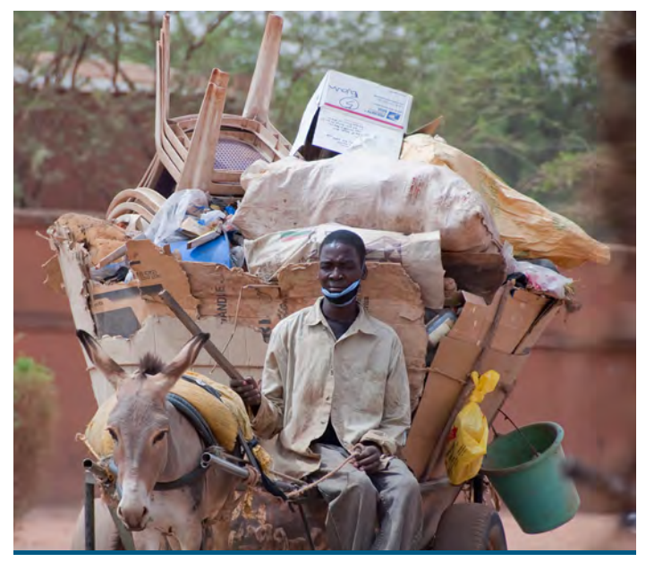
A garbage collector's cart in Ouagadougou.

Some 76.5 of Burkina Faso's urban residents live in slums, according to UN estimates.