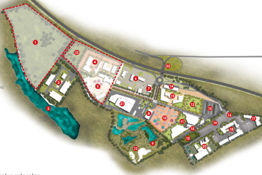
Figure 2: Magumu mixed-use market masterplan

upon the land values of undeveloped property and upon a property's "developed" functions (residential, commercial, public, industrial, non-agricultural and other). The undeveloped land tax would serve as the source of income to the county government and the developed land tax would be an income source for the municipal boards.