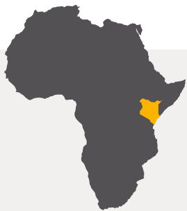
Figure 1: Campaign Cities map