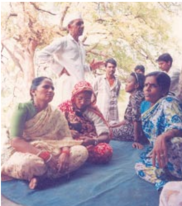
Learning exchange in Pune, India

IIED, ISTD, AUDI, the University of São Paulo, and other Alliance partners have been working to make Alliance information more accessible and in multiple languages. A user-friendly guide to the Cities Alliance and its funding application procedures has also been developed by the Secretariat and will support the Alliance's outreach initiatives.