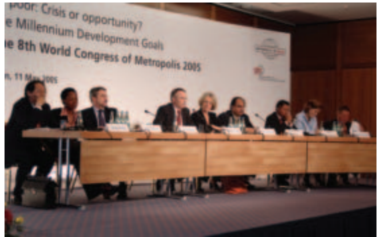
Development policy dialogue panel at the Metropolis Congress organised in collaboration with the Cities Alliance

The Eighth Congress of Metropolis offered a unique opportunity for the Cities Alliance to celebrate the fifth anniversary of its Berlin launch and the Cities without Slums Action Plan. The context was a well-attended development policy dialogue