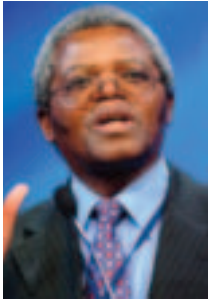
Father Smangaliso Mkhathswa, Mayor of Tshwane and UCLGA President

challenges still confronting local governments in many African countries. UCLGA members would have to engage in a ‘second liberation’ struggle, a fight for power-sharing entailed in the devolution of power and resources to local governments. This is a struggle that can be won only if local governments can establish responsible financial management parameters for themselves, promote participatory democracy among all stakeholder groups within their jurisdictions, and involve most of their residents in decision making on matters that affect their day-to-day lives.