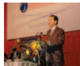
Deputy Prime Minister of Vietnam, Nguyen Tan Dung