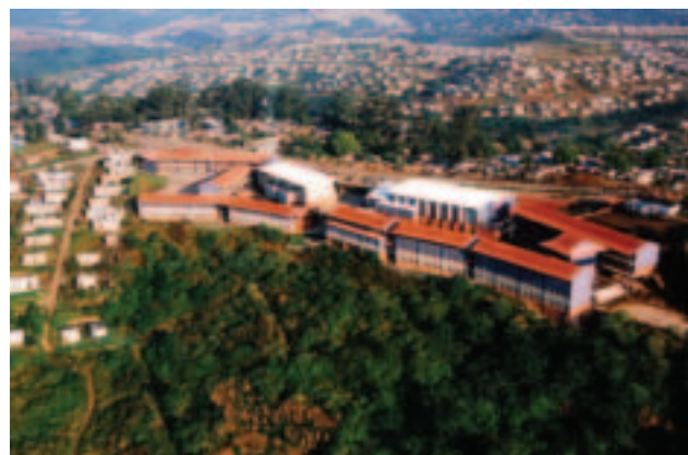
Aerial view of Cato Manor, eThekweni