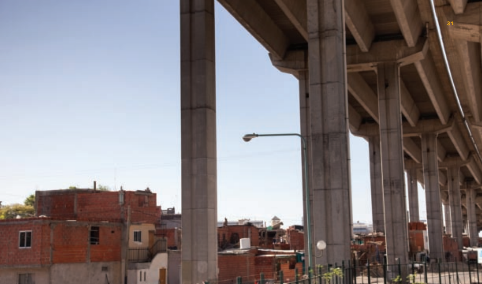
Slum under a bridge near La Boca in Buenos Aires, Argentina

T he fiscal year ending 30 June 2010 was a year of transition for Cities Alliance. More than $10 million in new Core funding allocations were approved during FY10, the most since FY06, as the Alliance closed its old grant facility on 31 March 2010. More than $9.3 million of proposals to be funded from Core funds were submitted by the closing date, of which $4 million were still in process at year end and will be carried forward into FY11.