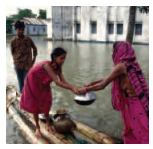
Bangladesh: Using a raft made of trunks of banana tree, a family transports pots of drinking water after a flood near Mymensingh.

Topics discussed included the impacts of city and urban growth on climate change; how to effectively measure the effects of climate change on urban quality of life, city assets, and local and national economies; alternatives to increasing the resilience of cities; and related costs and incentives required for successful implementation. Participants called for new tools to finance adaptation and mitigation policies, tools which are accessible to local governments and which take into account the uniqueness of the territories they will be used in.