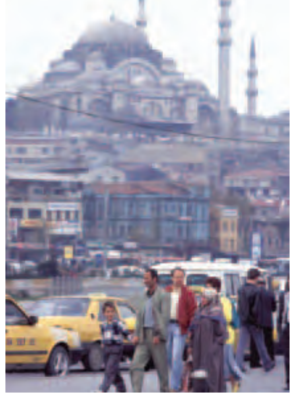
Street scene in Istanbul, Turkey, with the New Mosque (Yeni Camii) at the background.

Climate change and UCLG's increasing profile in the international community also took centre stage. Participants discussed the preparation of the second Global Report on Decentralization and Local Democracy (GOLD) which will focus on local finance strategies and, like the first report, will be prepared with the support of the Cities Alliance. At the strategic urban planning meeting, a number of cities made presentations highlighting their experiences in conducting urban planning exercises. Presenters included Durban, South Africa; Rosario, Argentina; Bilbao, Spain; Cologne, Germany; Moscow, Russia; and Daewu, South Korea. Cases of decentralised cooperation in support of City Development Strategies (CDS) were also presented including Johannesburg-Lilongwe and Marseille/Barcelona-Tripoli.