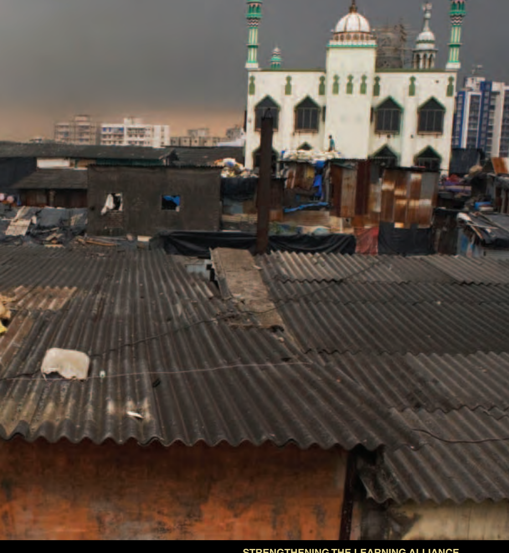
STRENGTHENING THE LEARNING ALLIANCE