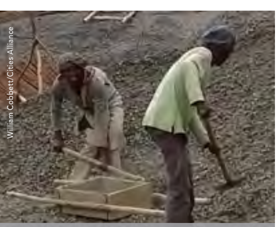
Ethiopia has undertaken a bold housing programme that relies on labour-intensive delivery with limited use of machinery.

With its diverse membership and experience, the Cities Alliance is in a unique position to facilitate the sharing of knowledge and learning. In recent years, the Cities Alliance has established a number of Joint Work Programmes with members and partners to gather lessons learned based on cumulative experience with slum upgrading and strategic urban development, as well as emerging issues such as climate change.