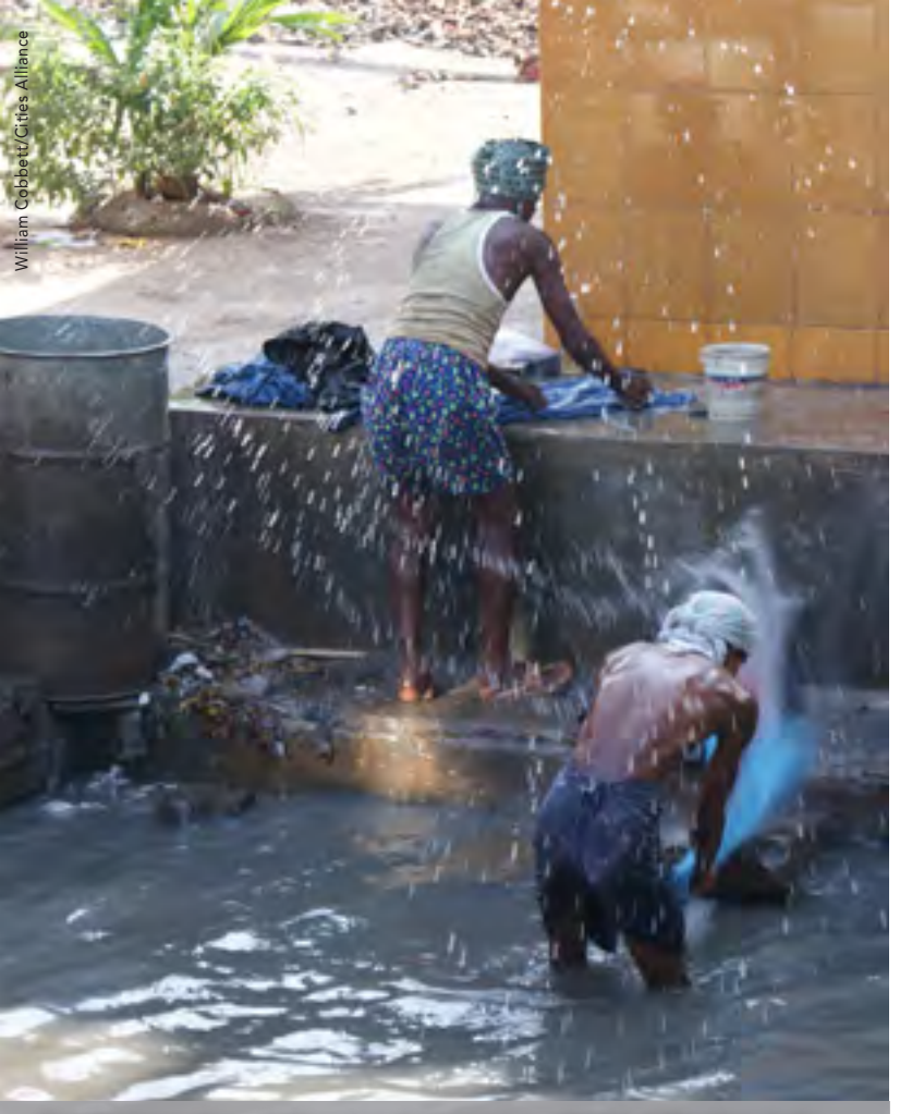
Residents washing clothes in a slum neighbourhood of Mumbai, India.