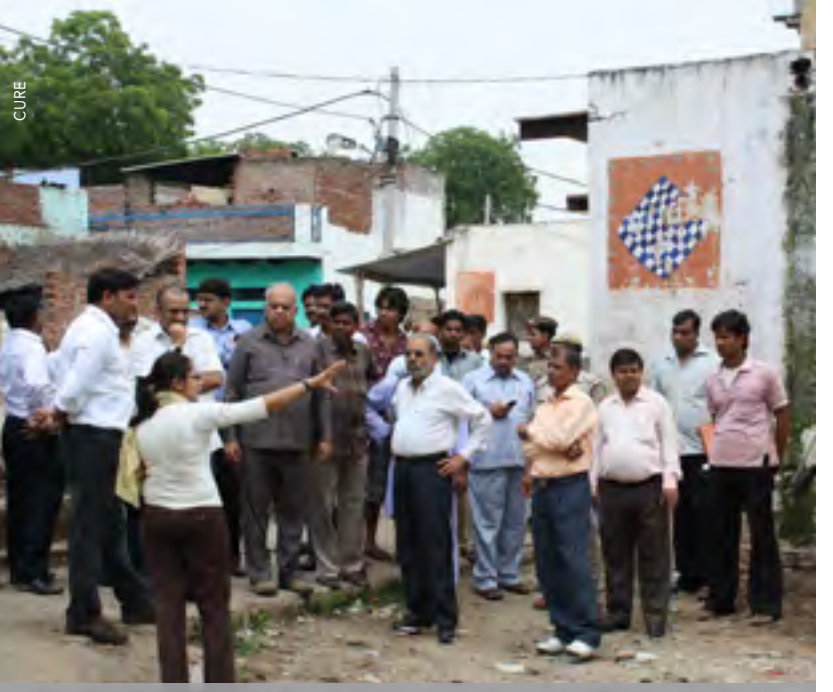
The Divisional Commissioner of Agra and other city officials visited Kachhpura in August 2011. As a result, the city allocated funds to pave all unpaved streets in Kachhpura and provide individual toilets to all households without access.