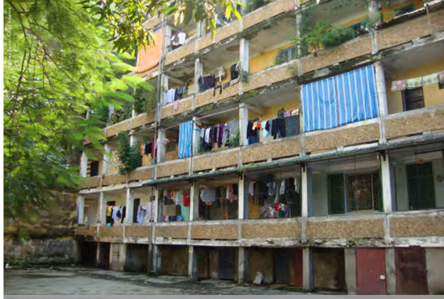
Dilapidated housing in Vinh, Vietnam.